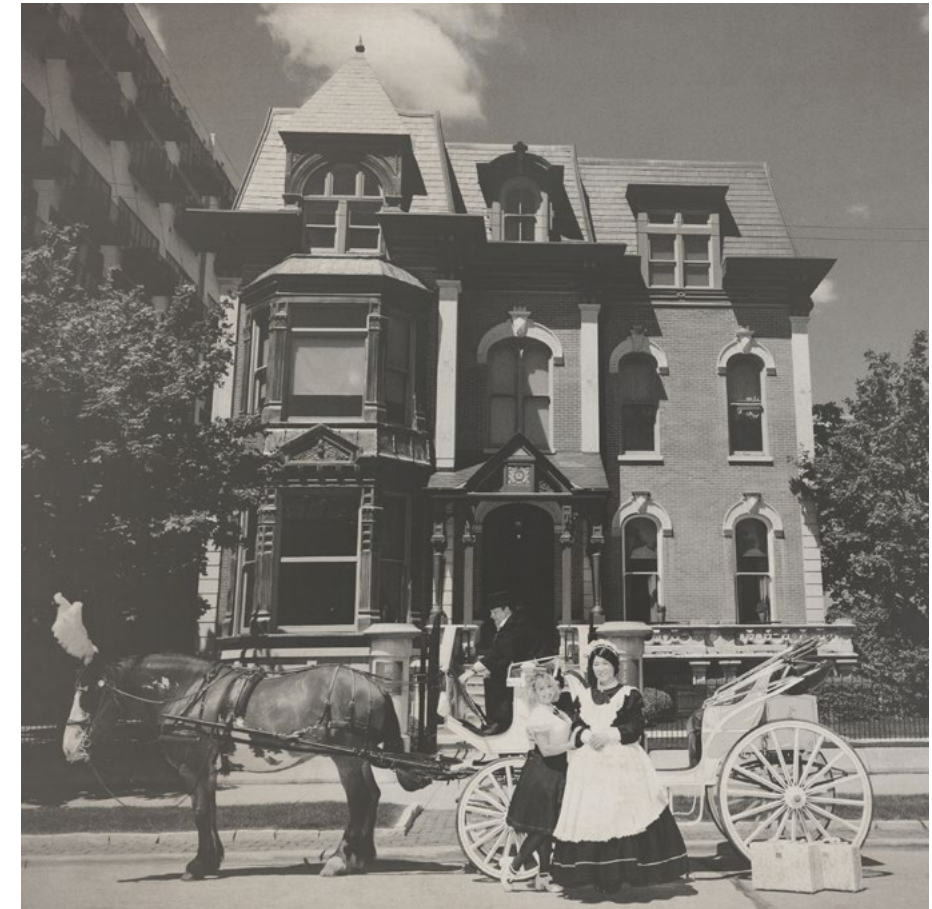
Chicago Landmark Wheeler-Kohn House Otis L. Wheelock, architect 1870

A rare survivor of the stately mansions built on the Near South Side prior to the Great Chicago Fire of 1871; this also ranks as one of the city's best examples of Second Empire architecture.